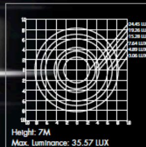
Candle Power Distribution